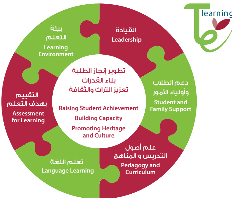
Figure 1: The Taaleem-Edison Learning Approach

During the first curve of improvement, the TEL partner schools were involved in a range of initiatives related to improving individual leader and teacher knowledge, skills, confidence and understanding. During Year 1, the TEL team focused on creating the conditions for greater independence and accountability. Figure 1 below illustrates the six strands of the Taaleem-EdisonLearning approach.