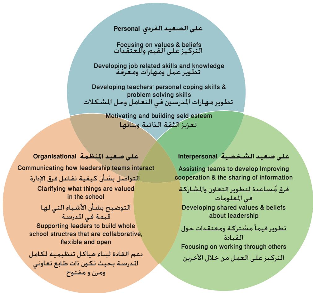
Figure 2: Capacity Building

The unlocking of learning through partnership in action is accelerated through the capacity building methodology. During the first curve of the partnership, the members of the Taaleem-EdisonLearning team lead the change process; however, by the time of the second curve, the teachers in the school were taking responsibility for some aspects of the change programme. In order to successfully facilitate this, the TEL team “walked side by side” with the teachers and school principals. Towards the end of the second curve, the school stakeholders were able to lead their own developments with the support, coaching and mentoring of the TEL team.